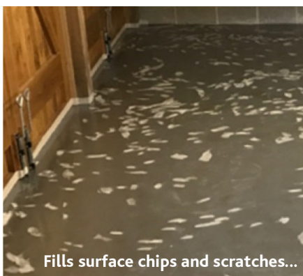
Fills surface chips and scratches...