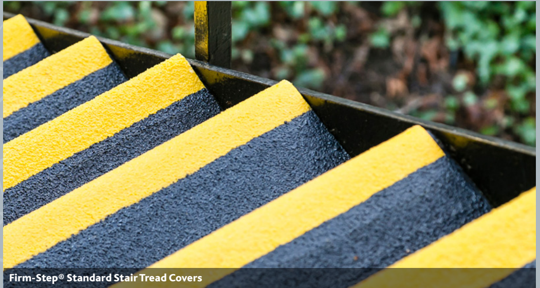
Firm-Step® Standard Stair Tread Covers

The UK's leading direct supplier of industrial strength flooring products