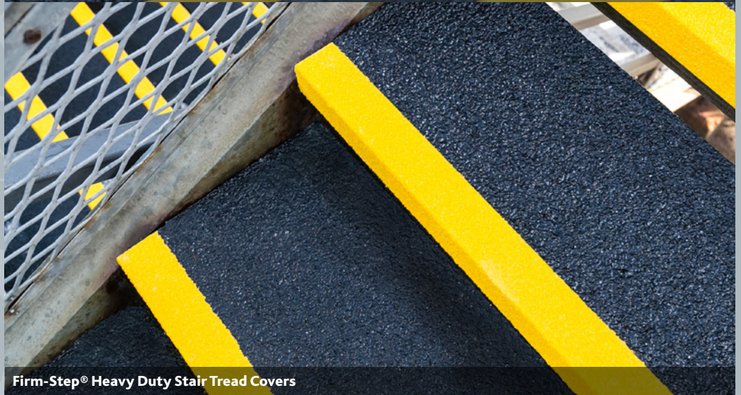
Firm-Step® Heavy Duty Stair Tread Covers